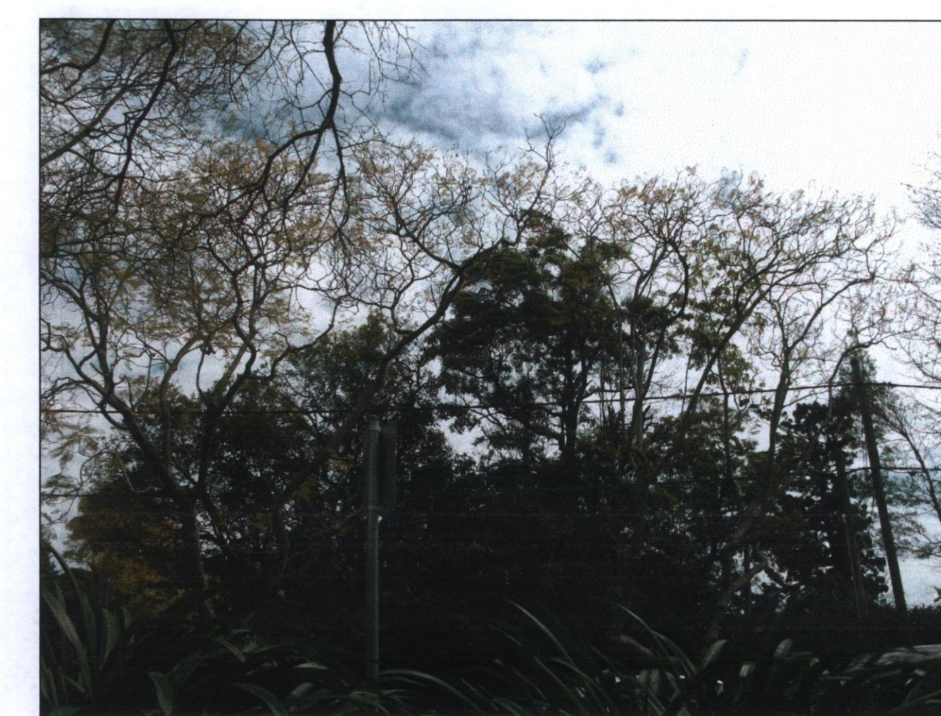
PHOTOGRAPH OF No. 10 CLEVELAND STREET TAKEN FROM THE HEADLAMP POSITION OF A LARGE CAR EXISTING THE PROPOSED KNOX YELDHAM FIELD CAR PARK.